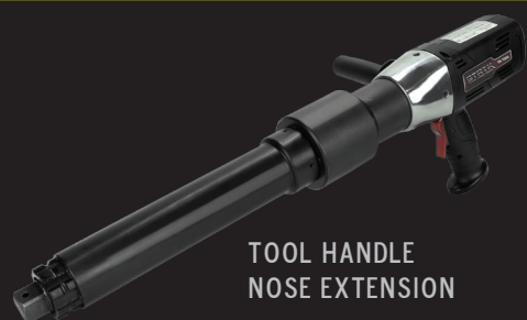
TOOL HANDLE NOSE EXTENSION

ACCURATE - A TRUE TORQUE INSTRUMENT INDUSTRIAL - BUILT FOR EXTENDED DAILY USE ACCOUNTABLE - FOR TORQUE / ANGLE / APPLICATION