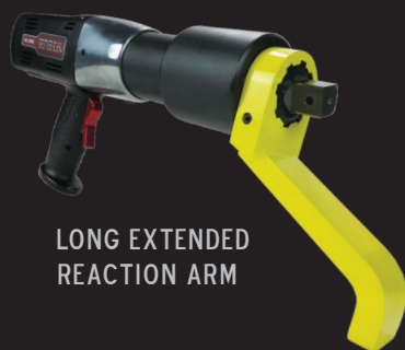
LONG EXTENDED REACTION ARM