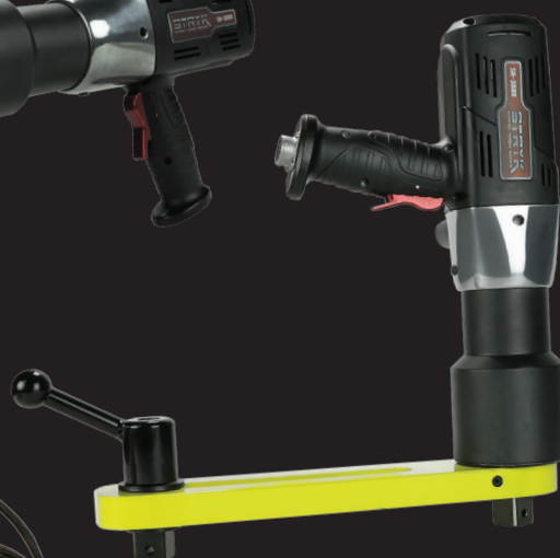
SLIDING STRAIGHT REACTION ARM