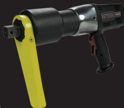
STRAIGHT REACTION ARM